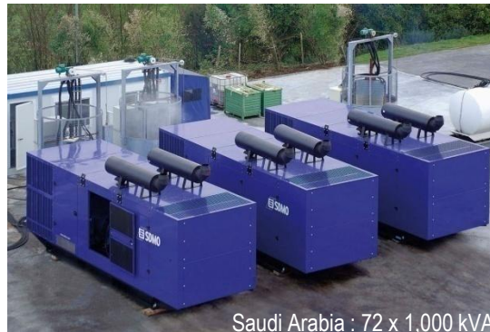
Saudi Arabia : 72 x 1,000 kVA