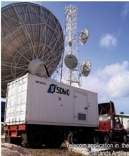
Telecom application in the Netherlands Antilles