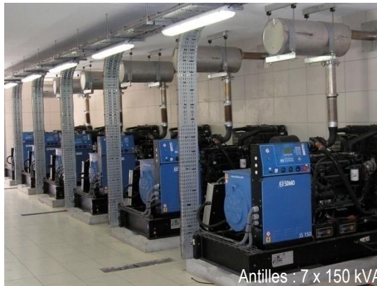
Antilles : 7 x 150 kVA