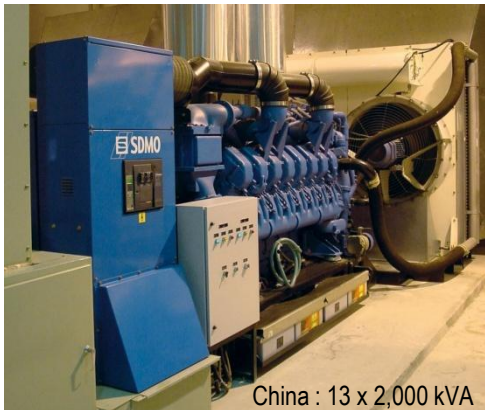
China : 13 x 2,000 kVA

From a residential set generating a few Kw to a station generating several megawatts, both in America and across the world, in the public or private sector, SDMO is a partner for all activities where people need energy.