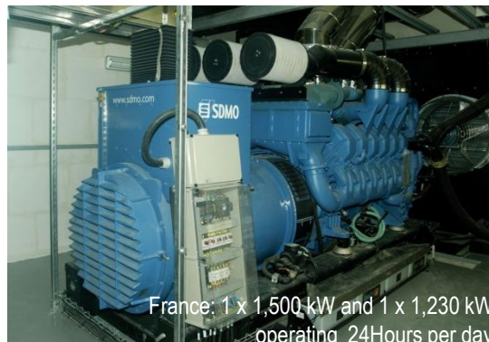
France: 1 x 1,500 kW and 1 x 1,230 kW operating 24Hours per day

Today, power requirements become more specialized each day. The SDMO generating sets meet the specifications of all businesses. Its know-how is recognized in many sectors :