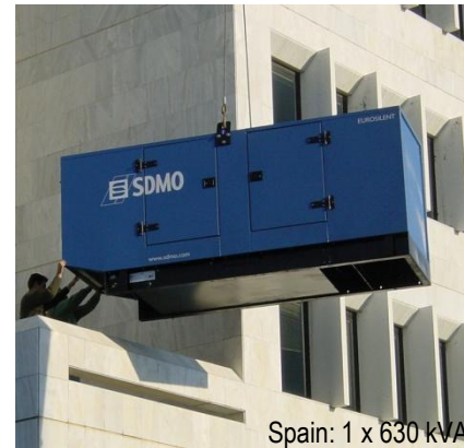
Spain: 1 x 630 kVA